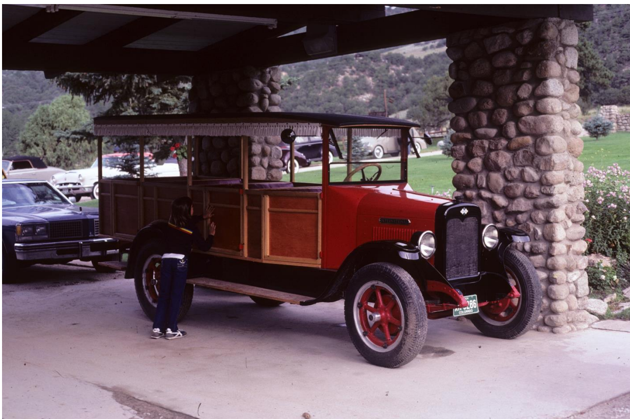
Mount Princeton Lodge courtesy wagon.