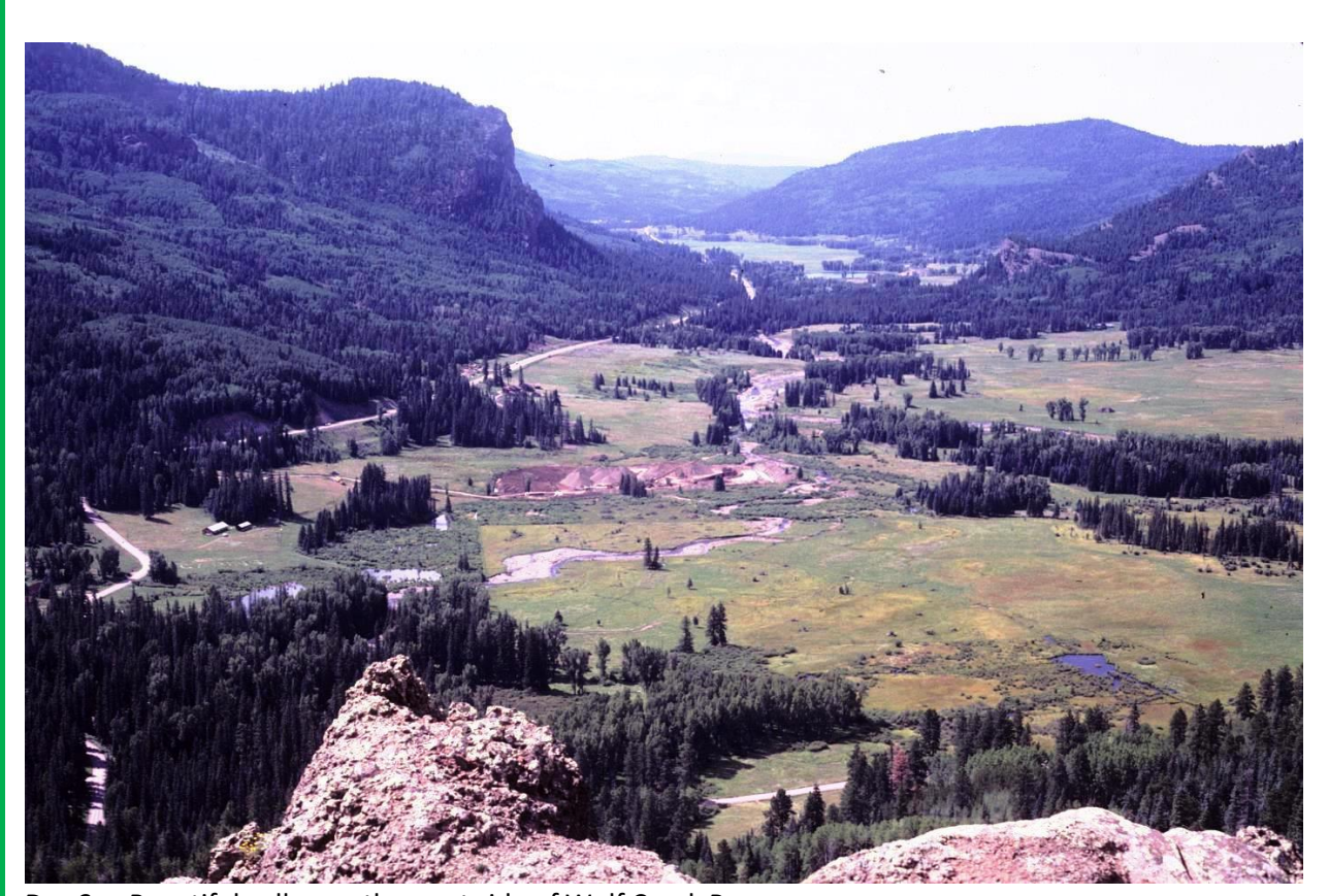
Day 3. Beautiful valley on the west side of Wolf Creek Pass.