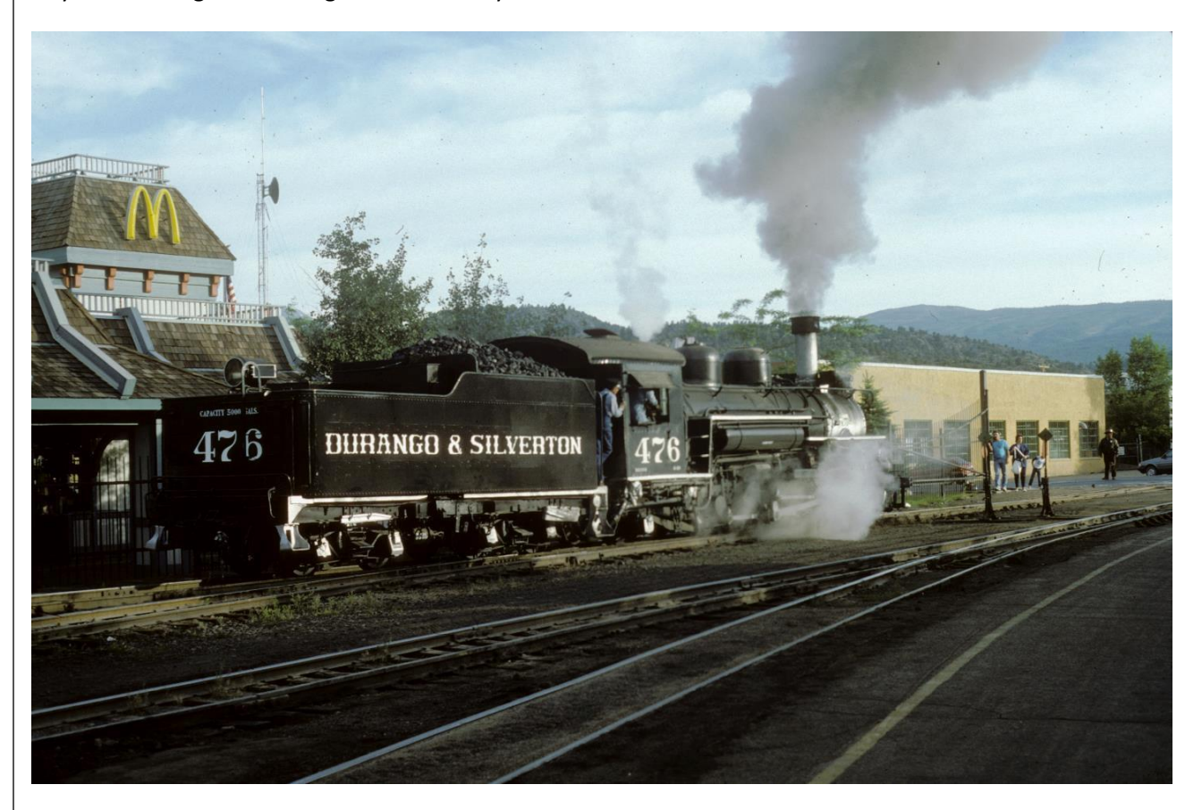
Day 4. Most of us rode the narrow gauge train to Silverton, and back.