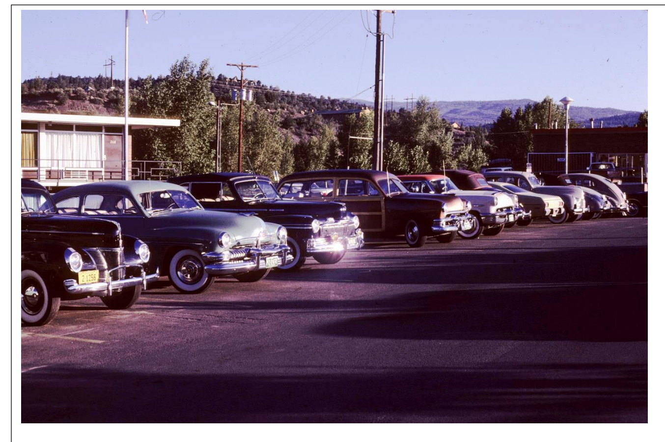
Day 3. Overnight in Durango at the Holiday Inn.