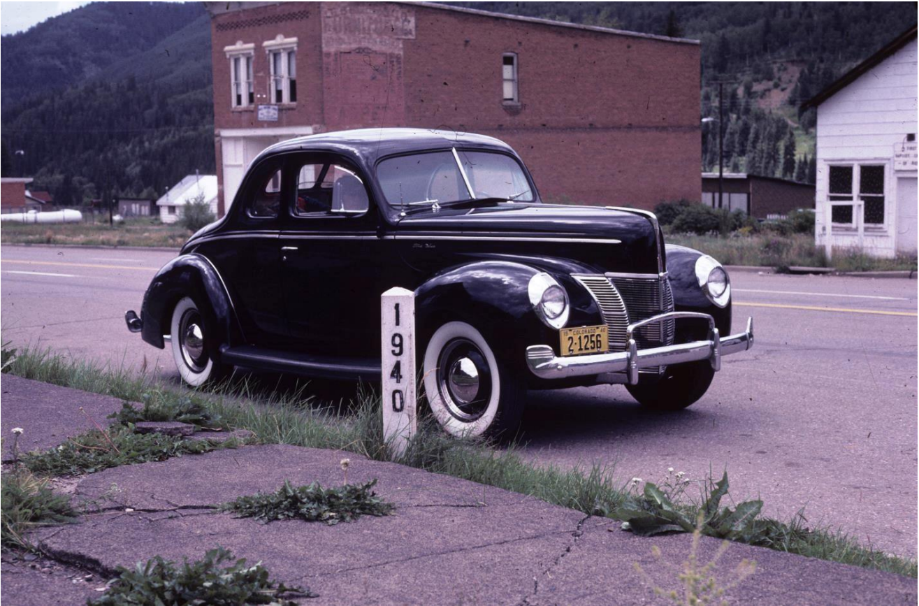
Day 5. Rico. Street address marker in Rico. Harry's 40 coupe.