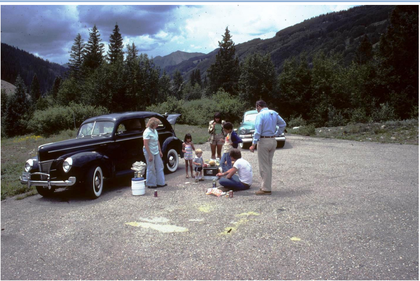
Day 5. Lunch stop on the way from Dolores to Telluride . Jim Corbett & Lou Mraz families