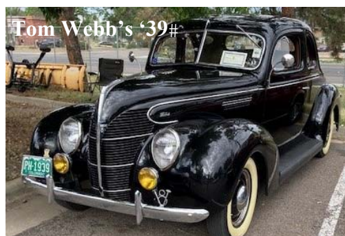
Tom Webb's '39#