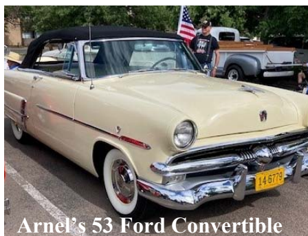
Arnel's 53 Ford Convertible