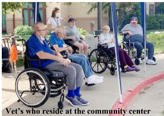
Vet's who reside at the community center