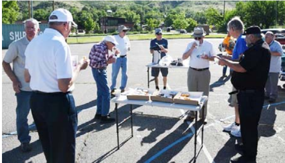
Everyone enjoying the Coffee and Donuts