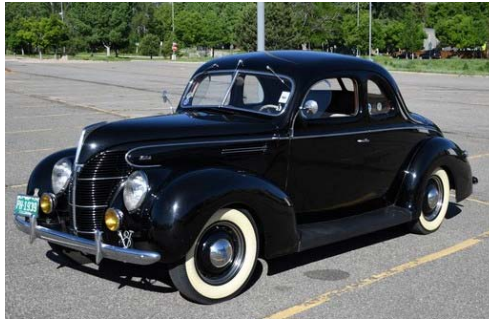
Tom's '39 did just fine