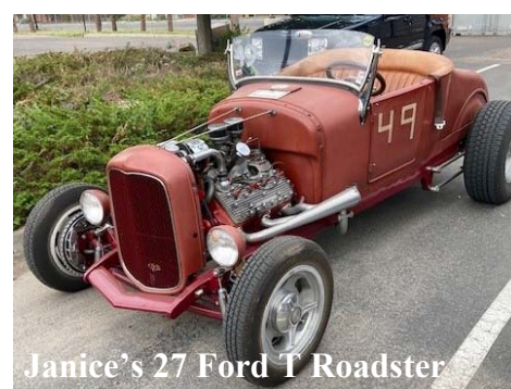
Janice's 27 Ford T Roadster