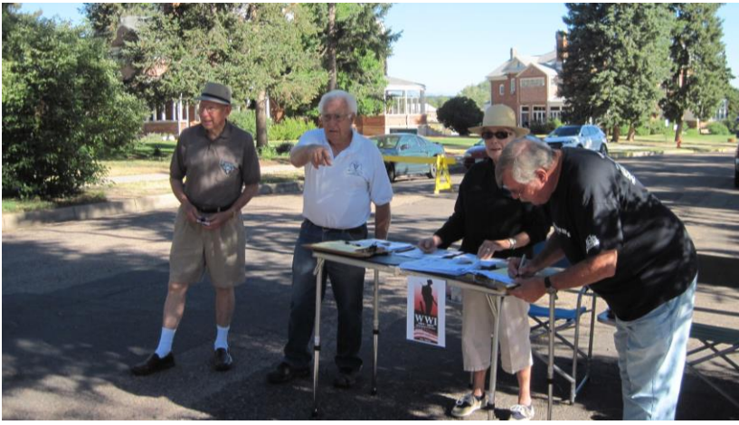
Fords at the Fort

What a great variety of cars. Thanks everyone for attending