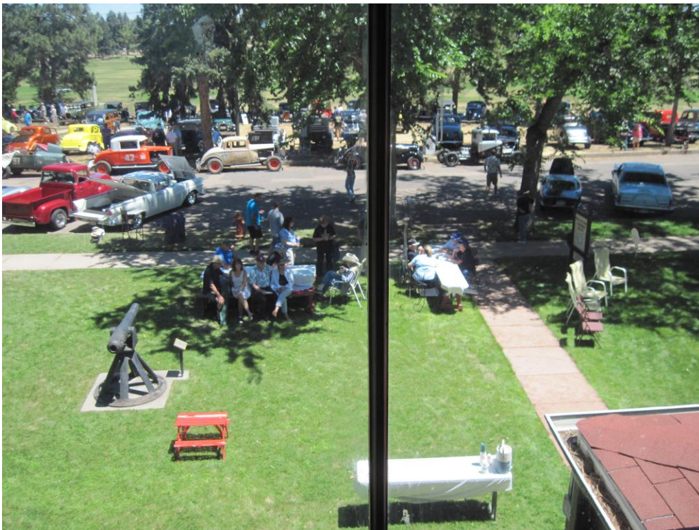
More Photos Fords at the Fort