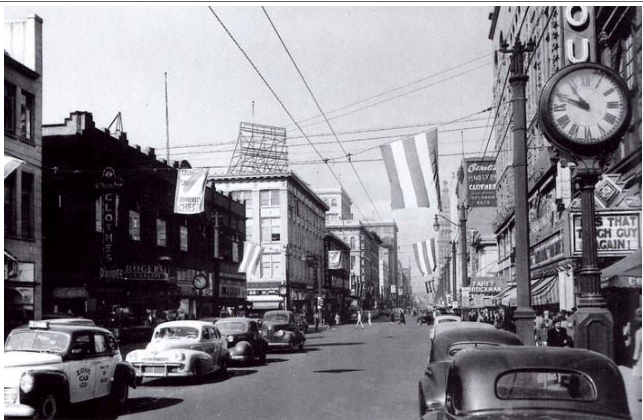
Old Denver Photo

Racine, Wisconsin South Bend, Indiana Pawnee, Indiana .