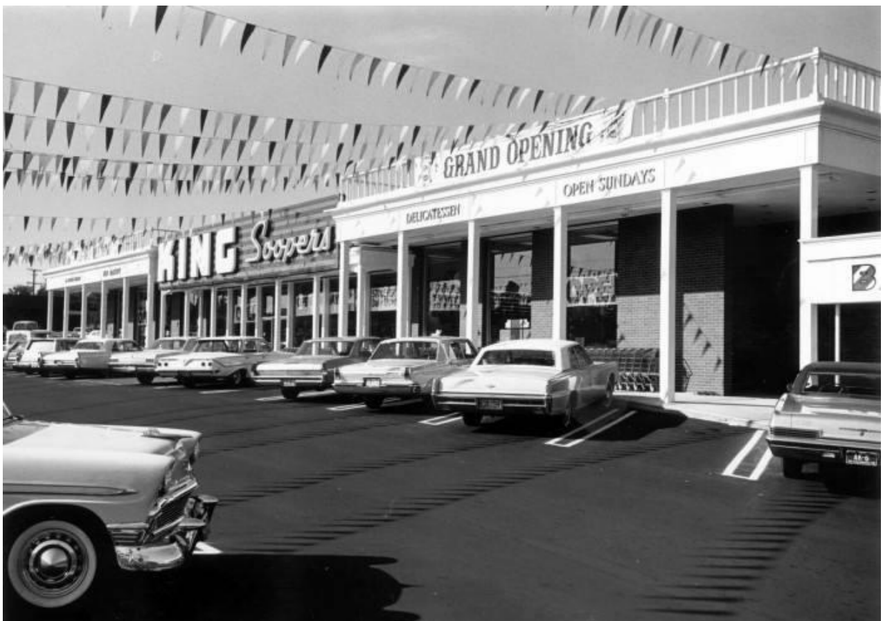
Old Denver Picture