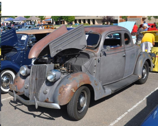
Doug Weinell's '36 survivor