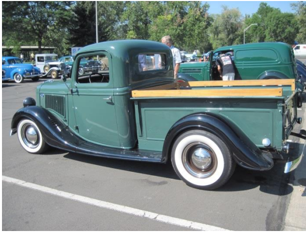
All Ford Patty's Ford Truck