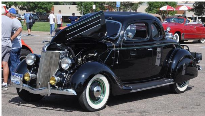
1936 5 Window with Skirts