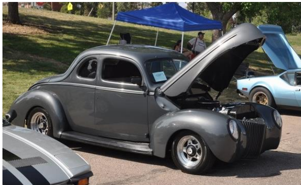
1939 5 Window