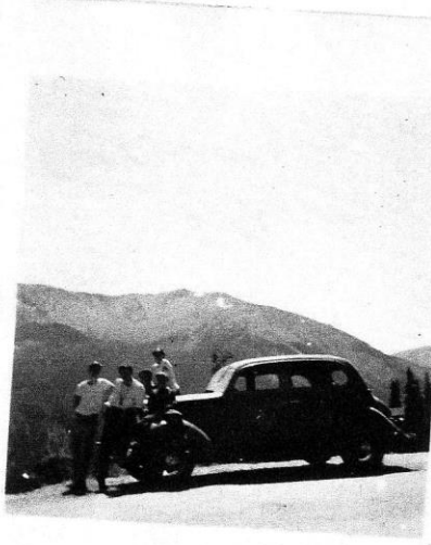
EAST Side Bearhood PASS 35 Ford AND 6-kids 15-16 yrs old - good Times We MADE IT. AMEN, 1950 OVERT BACK