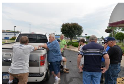
At Auburn Hotel