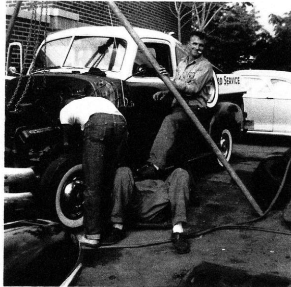
Olds 88 ENGINE INTO CHEV P/U THE HARD WAY - THE ONLY WAY