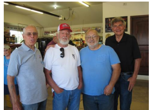
Four of the Garage Owners