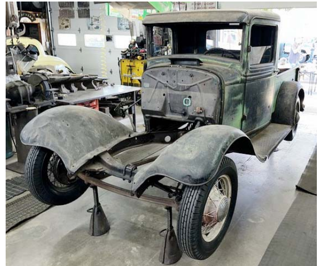
Charlie's current project