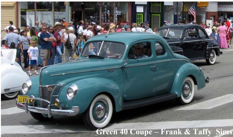
Green 40 Coupe – Frank & Taffy Sims