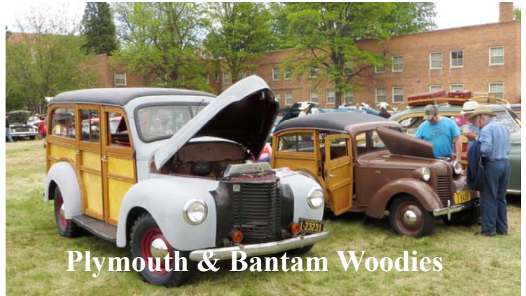
Plymouth & Bantam Woodies