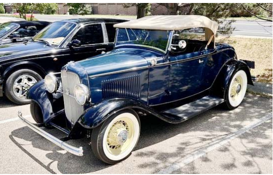
The Distributor, Vol 54, Issue 8, August 2024