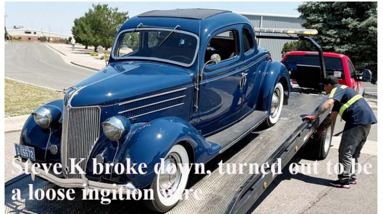
Steve K broke down, turned out to be a loose ignition wire