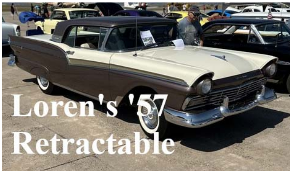
Loren's '57 Retractable