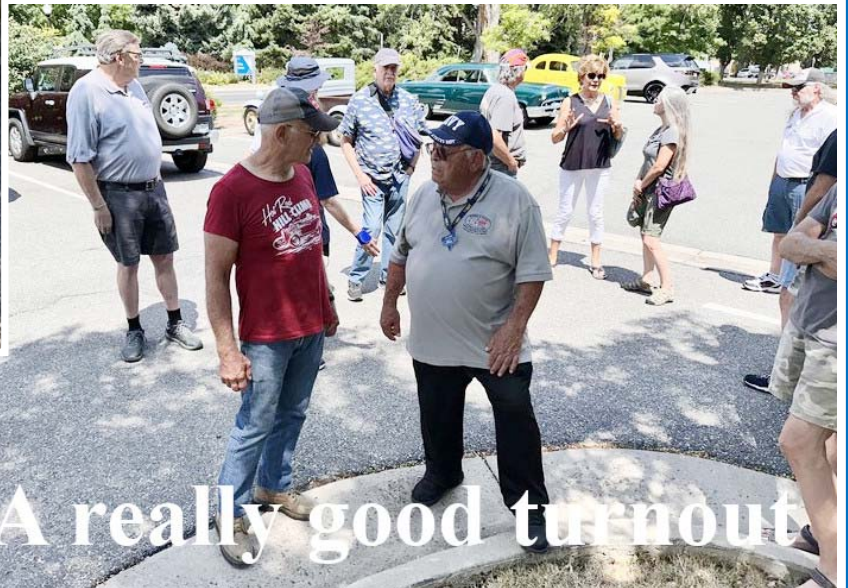
A really good turnout