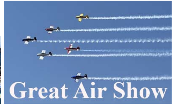
Great Air Show