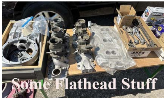
Some Flathead Stuff